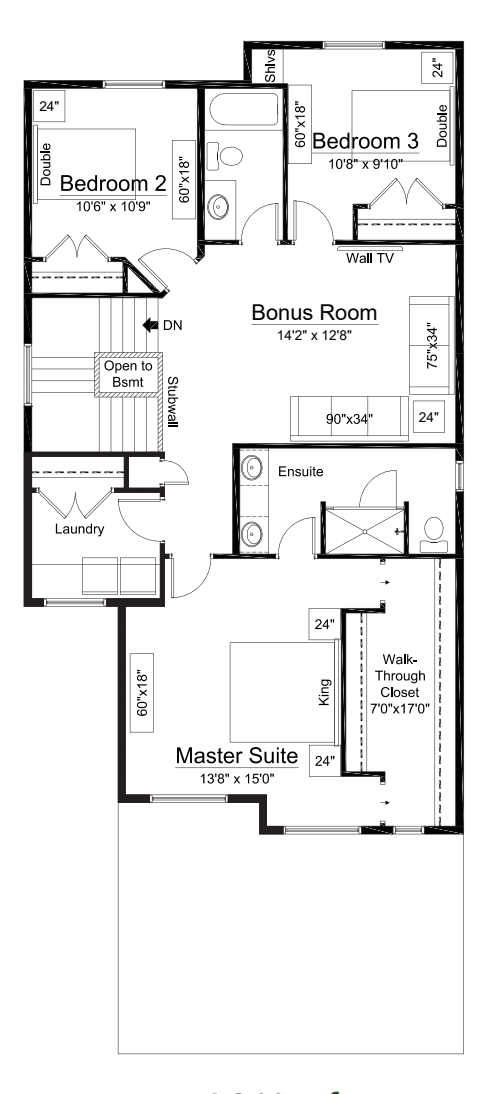
1,266 sq ft